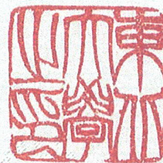
Official Seal of Tohoku University